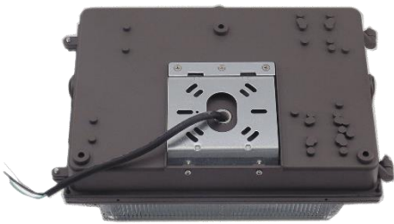
Quick Mount Back Plate